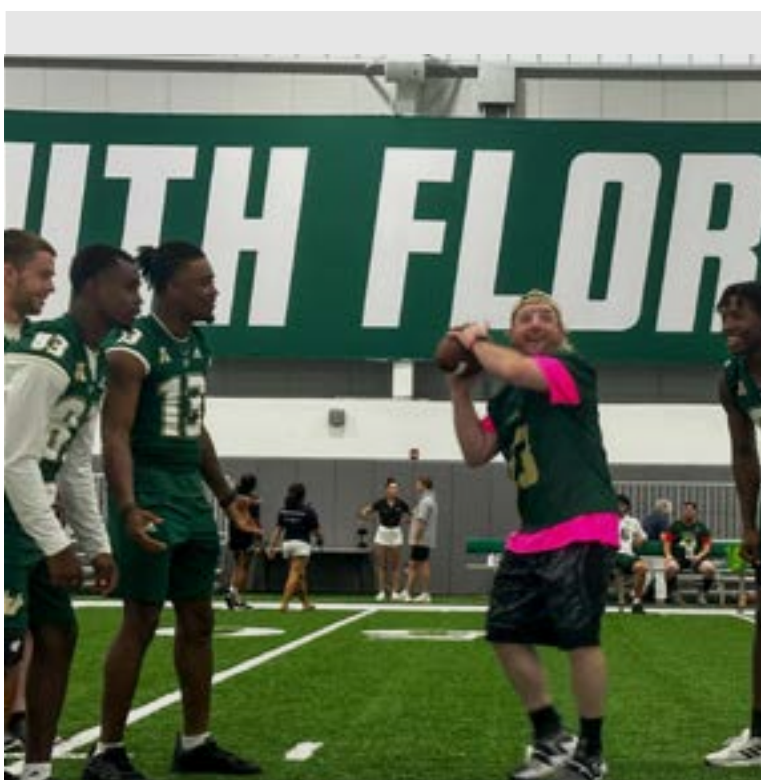
At one of the stations, participants competed in a throwing competition.