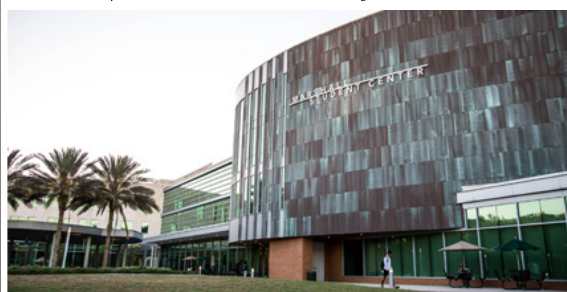
Black Heritage Month events return to all three campuses with an expanded focus on intersectionality among Black identities.

"The Office of Multicultural Affairs has been really intentional about programming with student organizations because this is their student experience on campus and we want to be able to support them and do the things that they would like to see," she said.