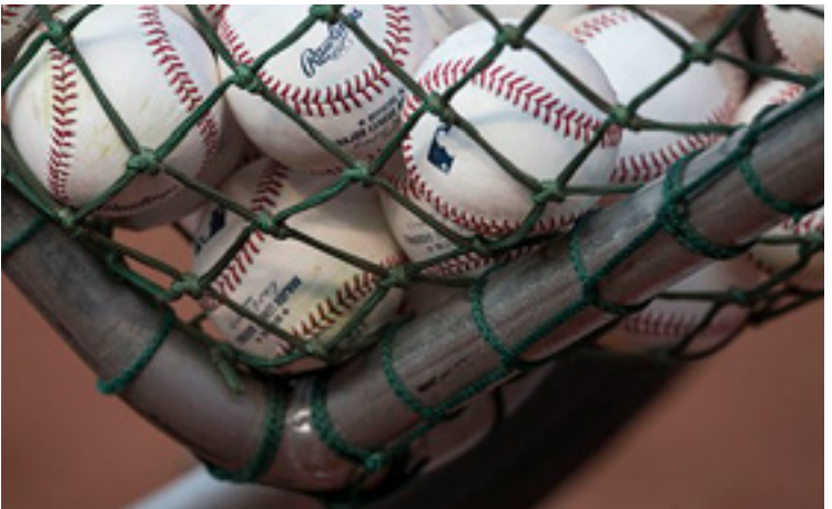
The 2022 MLB season is threatened by the league's ongoing lockout which started Dec. 2.