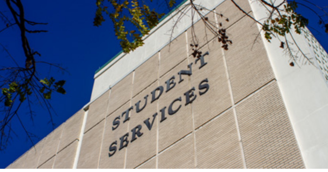
Royal Aire will replace multiple air handling units to improve ventilation in the basement and first, second and fifth floors.