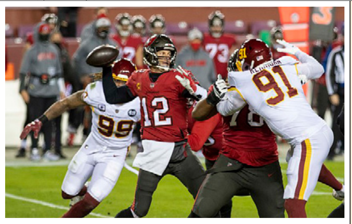
Brady led the Buccaneers to a 13-4 record in 2021-22 and victory in the Wild Card Round before being eliminated in the Divisional Round.