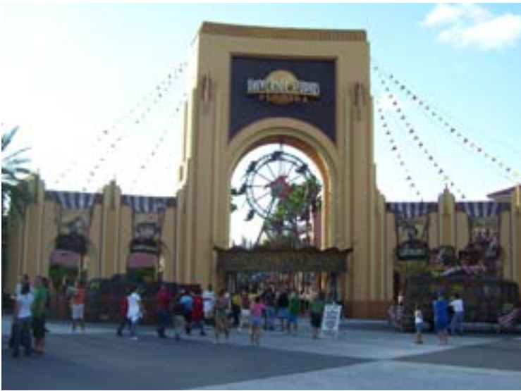
After a year of limited runs, both events are back with a full return to normal operations for the first time since 2019.

If you're looking to save a bit of money and gas, and still experience the thrills first hand, Howl-O-Scream is a great opportunity to do so, especially if you live close to Busch Gardens. If you're desiring a more extreme