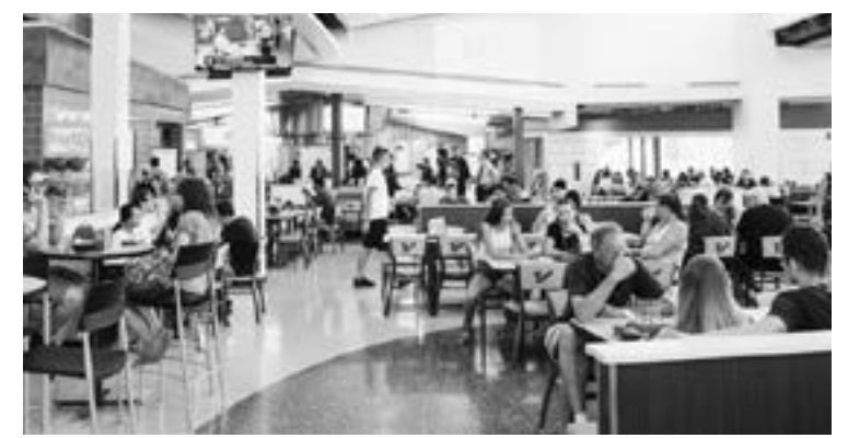
Many students find halal options on campus dining halls to be inadequate — if not absent entirely. SPECIAL TO THE ORACLE

Cicalese stressed the importance of students asking dining managers questions