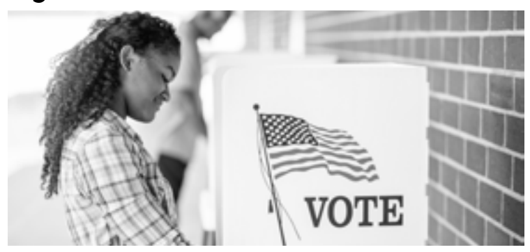
There's no good reason to put barriers between voters and the ballot box. SPECIAL TO THE ORACLE

forget to update their voting address after they move, which can make it confusing to find their polling location on election day. A USF student might wake up in Tampa ready to vote, only to realize their polling place is back home in Miami.