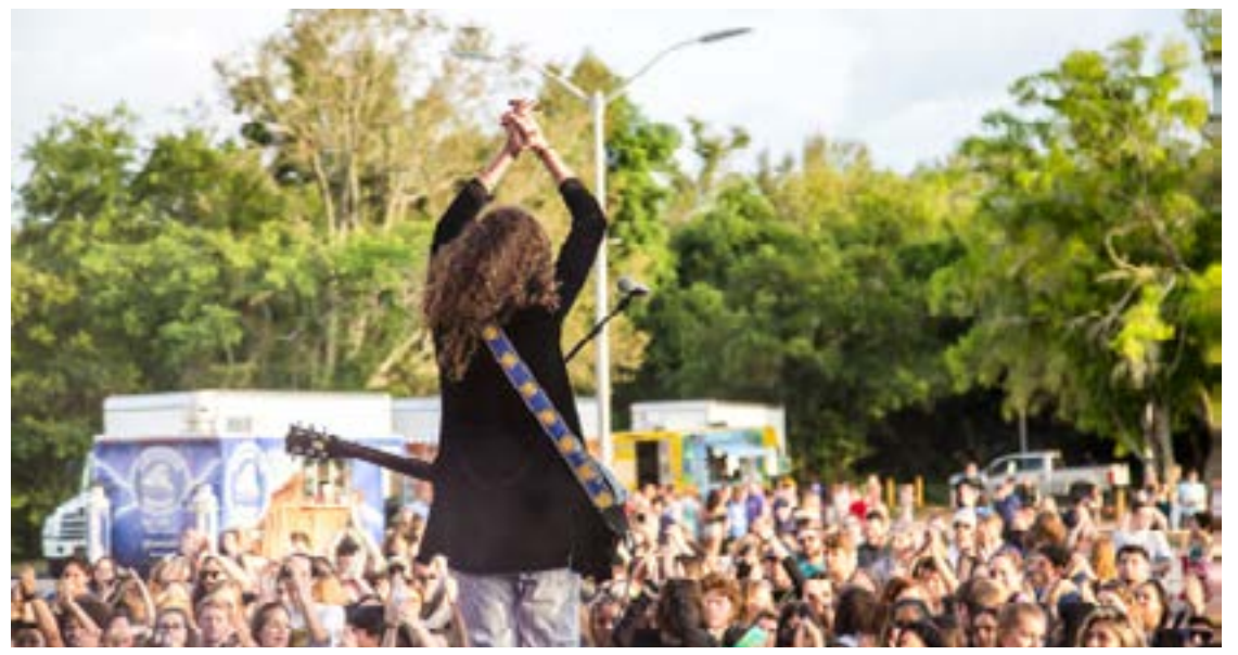
Last year, Bullstock's lineup consisted of Timeflies, 3OH!3, Lovelytheband and the Battle of the Bands winners Sick Hot and Taverns.

Based on the survey results, CSI reaches out to the middle agent — who works as a liaison