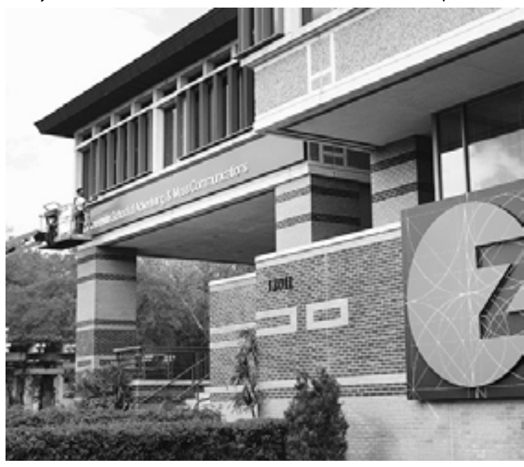
The Zimmerman School of Advertising and Mass Communications in Tampa and the Department of Journalism and Digital Communication in St. Pete have mutually agreed to not consolidate. SPECIAL TO THE ORACLE

Frechette said that the zip code duplication between both departments had a significant influence on the department's