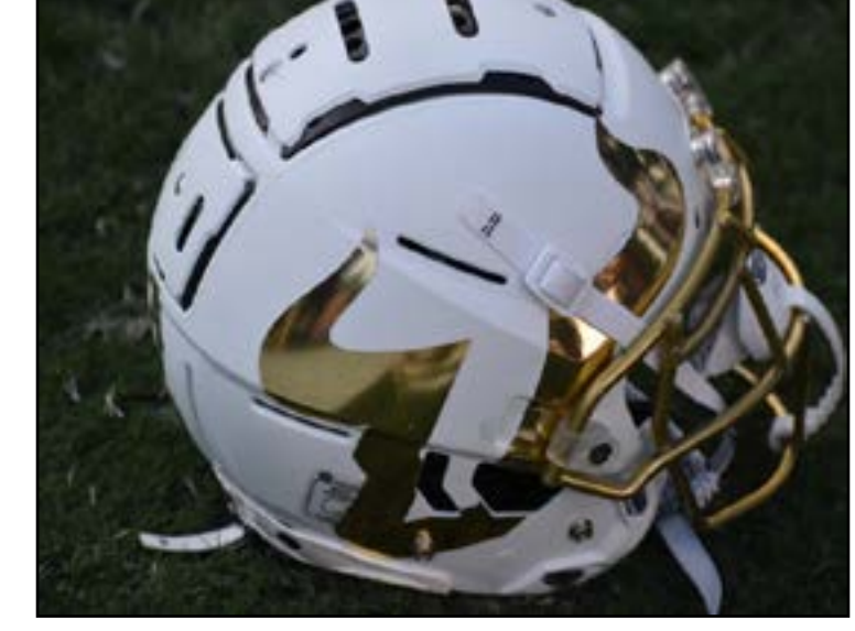
USF's loss to Memphis was one of the worst in program history.