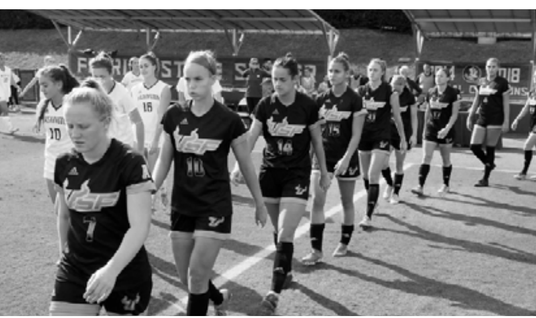
USF women's soccer's season ended Sunday in the Sweet 16.

Whether that will be enough to bring the War on I-4 trophy back to Fowler Avenue for the first time since 2016 will be seen later this week.