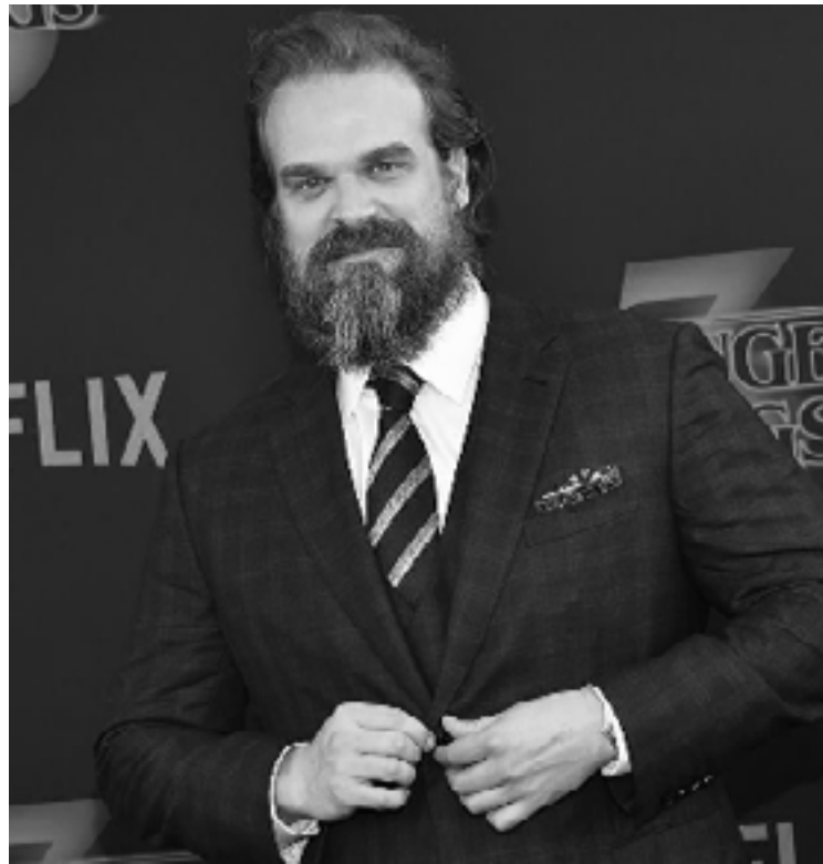
David Harbour is a mental health advocate who openly speaks about his depression and bipolar disorder as well as the stigma surrounding mental illness.

"We aren't sure if the scheduling conflict will last for a long while or if it's