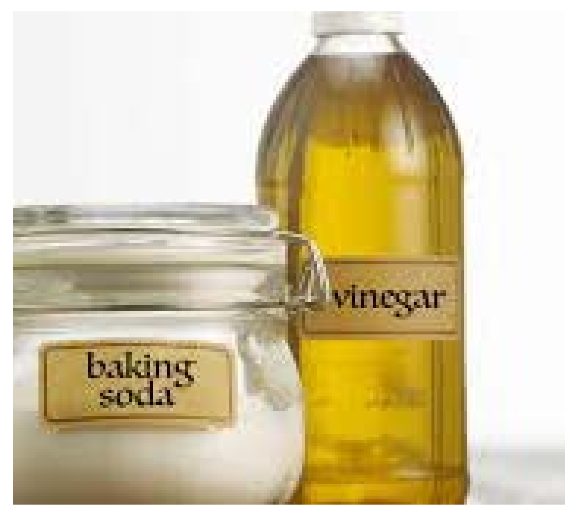
If you need a quick bathroom cleaner, mix together one cup of vinegar, half a cup of baking soda and hot water and leave in the tub for five minutes. SPECIAL TO THE ORACLE

Have you ever walked into your kitchen and wondered what that