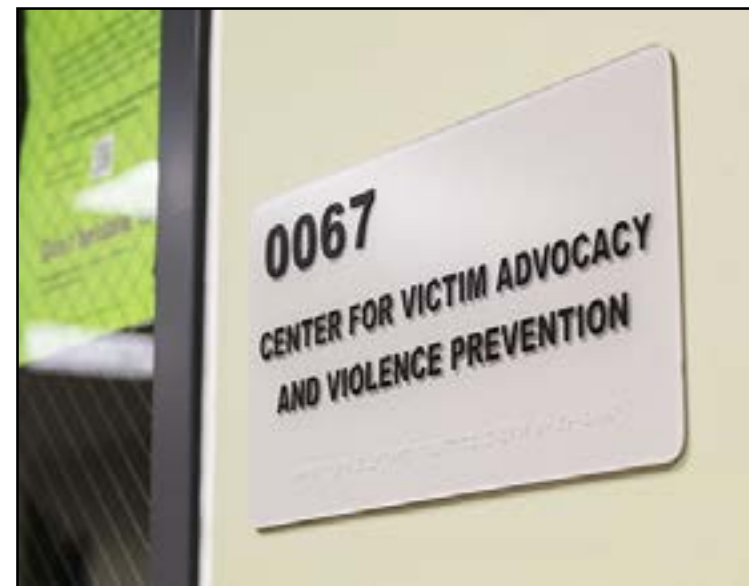
The Center for Victim Advocacy and Violence Prevention has endured a multitude of challenges and changes in leadership.